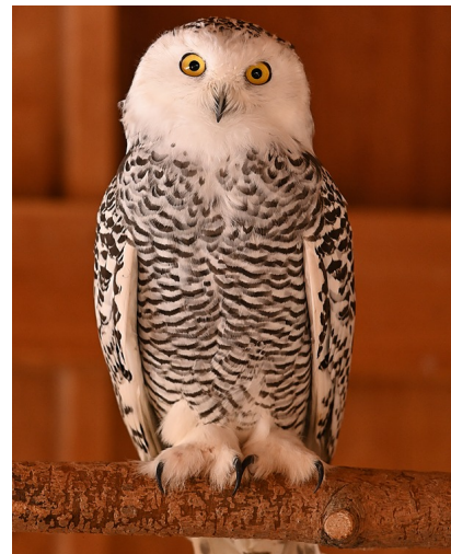
Snowy in her enclosure at Wild Skies Raptor Center on November 30, 2022.

More information & photos about Snowy, and about how you can help support her continued care, on ORI's website: